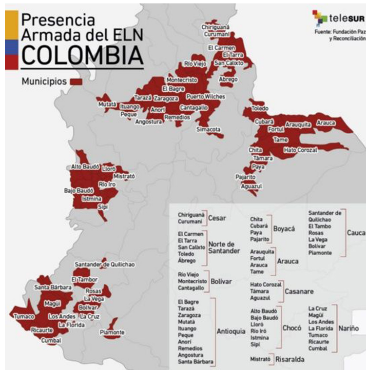
Map 1. Current ELN presence in Colombia.

Precisely, the ELN's persistence in its operations and areas of influence, although as a guerrilla group it was always in the shadow of the FARC-EP, shows its resilience.