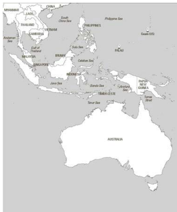
Map: Australia and its surrounding region. Source: Adelphi Series, 61:490-492, pp. 10-12, DOI: 10.1080/19445571.2021.2187583 .